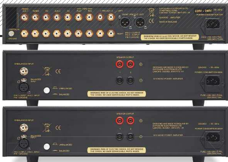
ABOVE: The preamp [top] offers five line inputs (one for an MM/MC phono option), a slot for a digital/DAC option, a tape loop and three preamp outs (two on RCA and one balanced on XLR). The power amp [below] has dual 4mm sockets that support bi-wiring. The input is single-ended (RCA) or balanced (XLR)

at turning on the aggression when the music demands as it is at illuminating the finer details of an intricate recording.