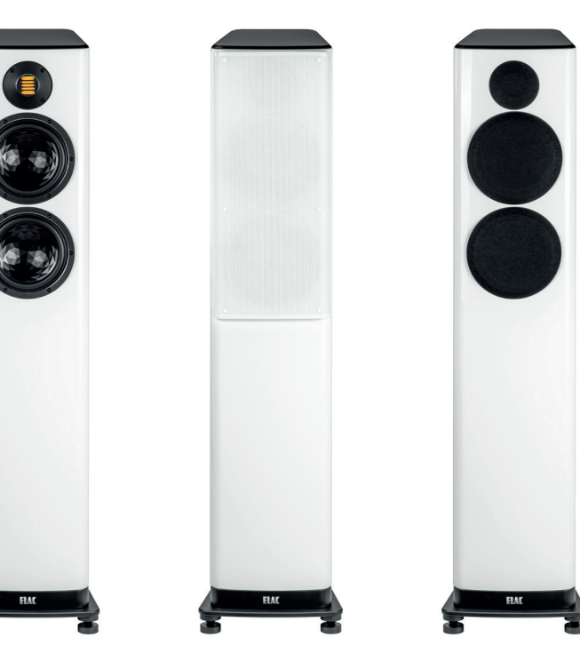
oudspeaker Grills are optional Accessories.